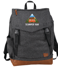
7950-72 Field & Co.® Campster Wool 15" Rucksack Backpack As Low As: $43.35 [C]