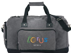
7950-96 Field & Co.® Hudson 21" Weekender Duffel Bag As Low As: $45.10 [C]