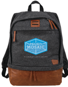
7950-71 Field & Co.® Campster Wool 15" Computer Backpack As Low As: $43.62 [C]