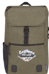
7950-38 Field & Co. Woodland Computer Rucksack As Low As: $46.10 [C]