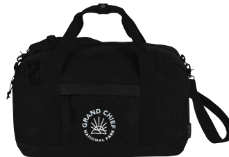
7950-13 Field & Co. Woodland 15" Duffel As Low As: $29.38 [C]