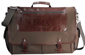
7950-55 Field & Co.® Classic 15" Computer Messenger Bag As Low As: $42.48 [C]