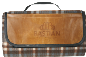
7950-52 Field & Co.® Picnic Blanket As Low As: $21.43 [C]