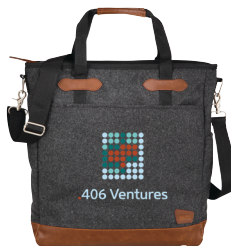
7950-86 Field & Co.® Campster Wool 15" Computer Tote As Low As: $38.52 [C]