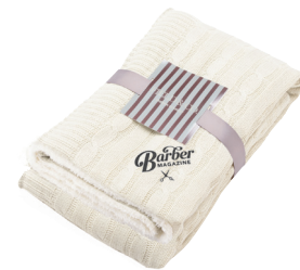
1081-11 Field & Co.® Cable Knit Sherpa Blanket As Low As: $63.50 [C]