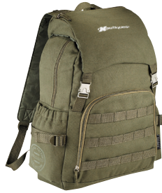
7950-75 Field & Co.® Scout 15" Computer Backpack As Low As: $45.05 [C]