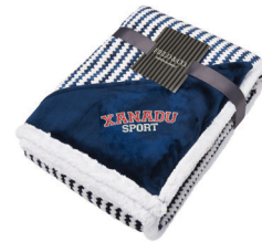
1081-12 Field & Co.® Chevron Striped Sherpa Blanket As Low As: $47.70 [C]