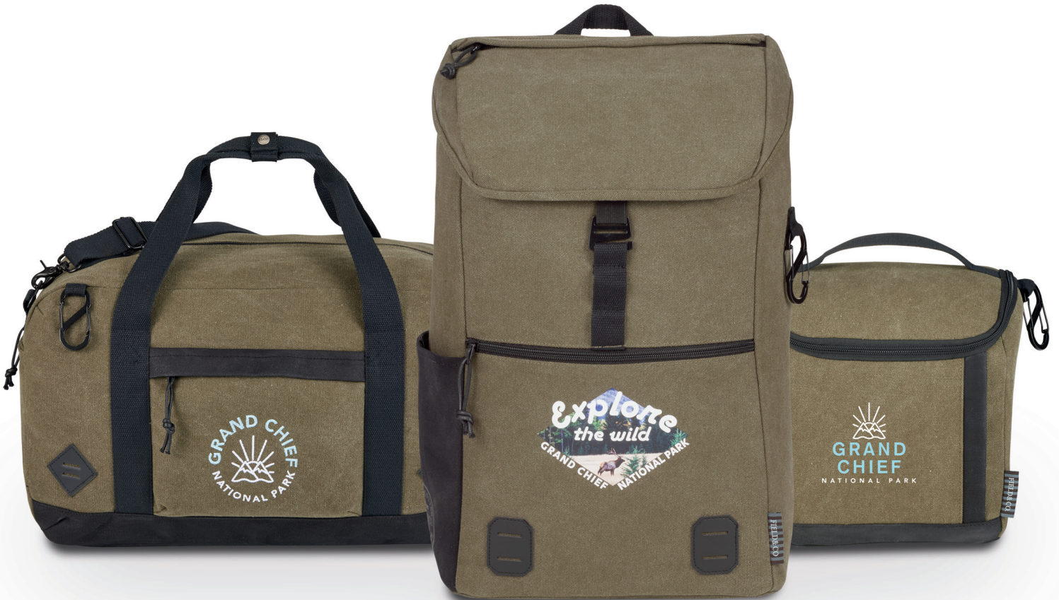
Field & Co. Woodland 15” Duffel | 7950-13

A mossy earth tone that'll look great with your favorite flannel shirt.