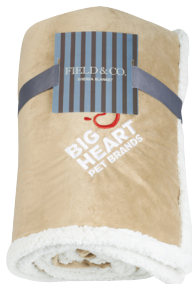
7950-51 Field & Co.® Cambridge Oversized Sherpa Blanket As Low As: $72.00 [C]