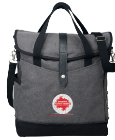
7950-93 Field & Co.® Hudson 14" Computer Tote As Low As: $31.85 [C]