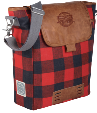
7950-29 Field & Co.® Campster 15" Computer Tote As Low As: $39.17 [C]