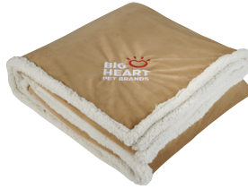
7950-57 Field & Co.® Sherpa Blanket As Low As: $43.25 [C]