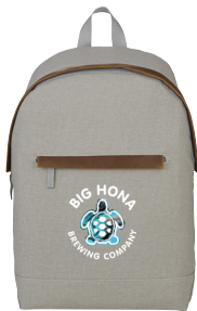
7950-28 Field & Co.® Book 15" Computer Backpack As Low As: $31.22 [C]