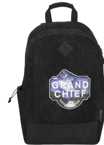
7950-37 Field & Co. Woodland 15" Computer Backpack As Low As: $31.50 [C]