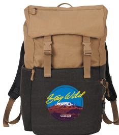
7950-31 Field & Co.® Venture 15" Computer Backpack As Low As: $41.08 [C]