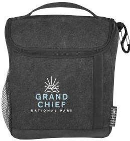
7950-04 Field & Co. Woodland 6 Can Lunch Cooler As Low As: $16.82 [C]