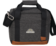
7950-77 Field & Co.® Campster 12 Bottle Craft Cooler As Low As: $42.35 [C]