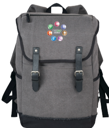
7950-94 Field & Co.® Hudson 15" Computer Backpack As Low As: $36.53 [C]