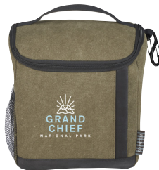
7950-04 Field & Co. Woodland 6 Can Lunch Cooler As Low As: $16.82 [C]