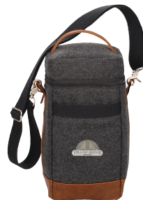
7950-78 Field & Co.® Campster Craft Growler/Wine Cooler As Low As: $24.08 [C]