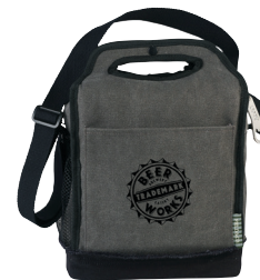
7950-24 Field & Co.® Hudson Craft Cooler As Low As: $25.08 [C]