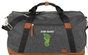
7950-79 Field & Co.® Campster 22" Duffel Bag As Low As: $47.37 [C]