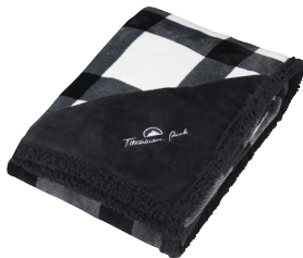
1081-51 Field & Co.® Buffalo Plaid Sherpa Blanket As Low As: $44.18 [C]