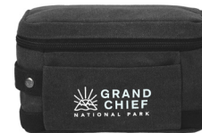
7950-09 Field & Co. Woodland Pouch As Low As: $12.70 [C]