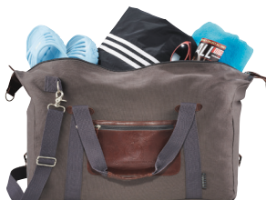
7950-80 Field & Co.® Classic 20" Duffel Bag As Low As: $39.18 [C]