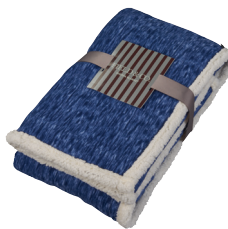
7950-62 Field & Co.® Heathered Fleece Sherpa Blanket As Low As: $41.62 [C]