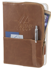
7951-01 Field & Co.® Campster Zip Journal As Low As: $18.93 [C]