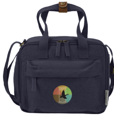
7950-41 Field & Co.® 6-Can Campus Cooler As Low As: $19.25 [C]