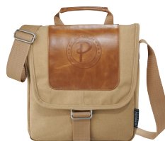
7950-58 Field & Co.® Cambridge 10" Tablet Messenger Bag As Low As: $25.85 [C]