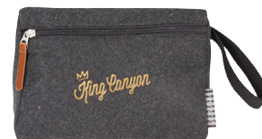
7950-74 Field & Co.® Campster Travel Pouch As Low As: $8.38 [C]