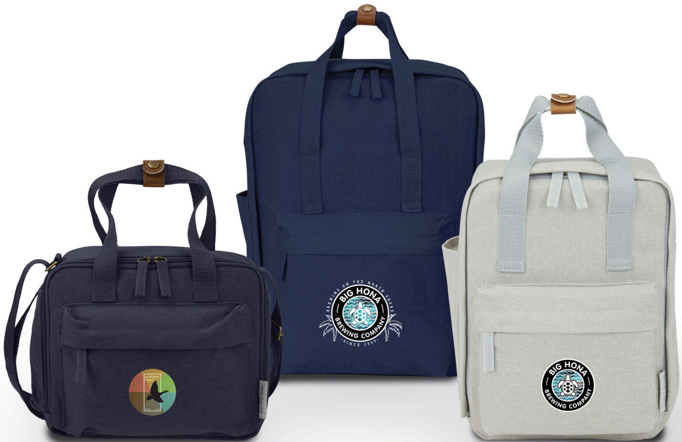
Field & Co.® 6-Can Campus Cooler | 7950-41 As Low As $19.25

Your companion for early morning classes, late night cramming and afternoon coffee breaks.