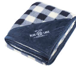
1081-52 Field & Co.® Double Sided Plaid Sherpa Blanket As Low As: $55.80 [C]