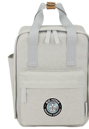
7950-34 Field & Co.® Mini Campus Backpack As Low As: $22.80 [C]