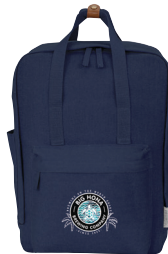
7950-26 Field & Co.® Campus 15" Computer Backpack As Low As: $33.58 [C]