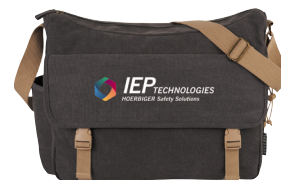
7950-32 Field & Co.® Venture 15" Computer Messenger As Low As: $35.53 [C]