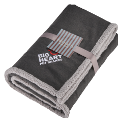
1080-67 Field & Co.® Oversized Wool Sherpa Blanket As Low As: $73.08 [C]