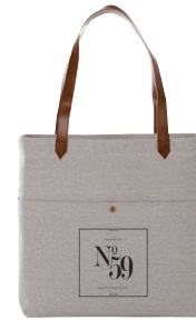
7950-19 Field & Co.® 16 oz. Cotton Canvas Book Tote As Low As: $22.67 [C]