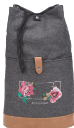
7950-25 Field & Co.® Campster Drawstring Rucksack As Low As: $25.75 [C]