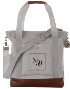
7950-20 Field & Co.® 16 oz. Cotton Canvas Commuter Tote As Low As: $30.05 [C]