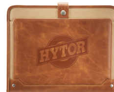
7950-01 Field & Co.® Cambridge Writing Pad As Low As: $41.78 [C]