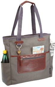
7950-21 Field & Co.® Classic Tote As Low As: $28.95 [C]